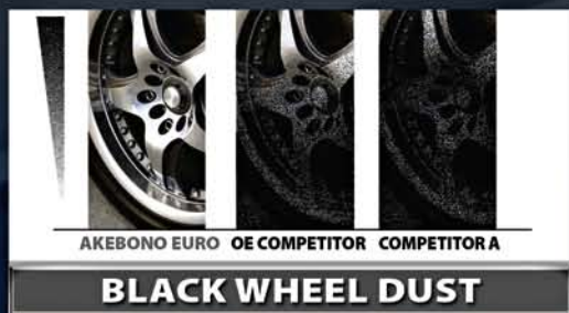
After 400 Stops

Akebono knows that owners of European vehicles have a particular passion for the performance standards and design aesthetics that are unique to European makes. Most drivers of European vehicles seek a driving experience using vehicle-handling techniques that are focused almost entirely on braking. This driving style is unforgiving on brake pads, making quality the critical decision point.