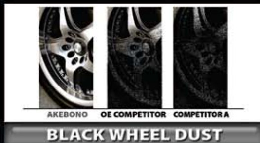
BLACK WHEEL DUST